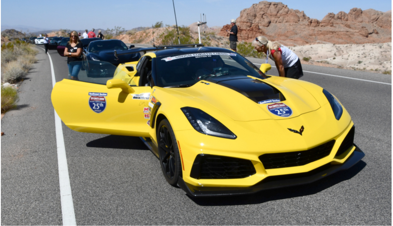
22 August 2019: The Southwest Corvette Caravan stops briefly in Valley of Fire State Park about 30 miles northeast of Las Vegas and 12 miles east of I-15. It was in the mid-90s that morning.