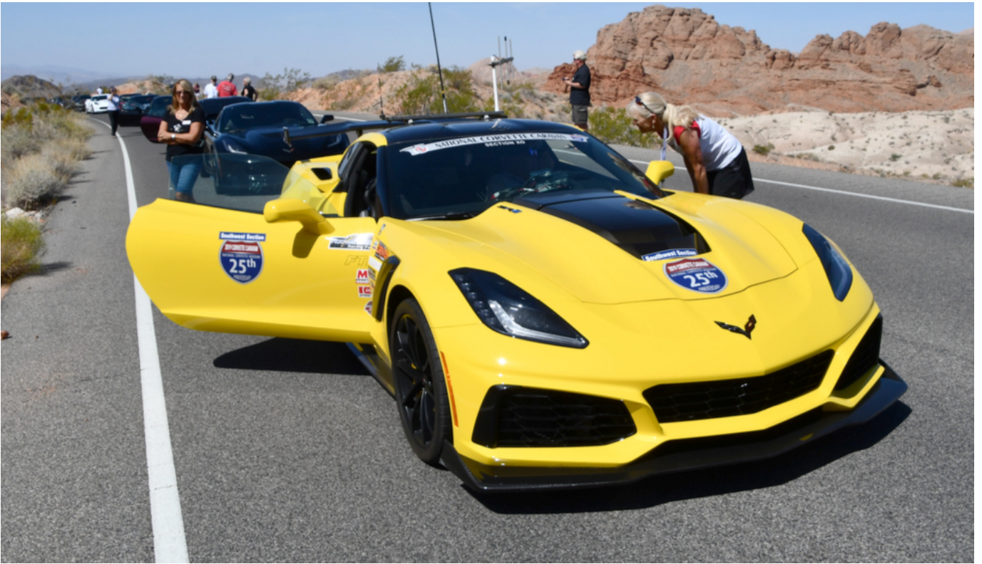
22 August 2019: The Southwest Corvette Caravan stops briefly in Valley of Fire State Park about 30 miles northeast of Las Vegas and 12 miles east of I-15. It was in the mid-90s that morning.

We won't deny it. We picked the hottest summer in a decade to stage the 2024 Southwest Caravan. At deadline for this eNews, the 3- to 4-week temperature outlook on the NOAA weather prediction site indicates higher-than-normal temperatures for the southwest and central parts of the U.S.