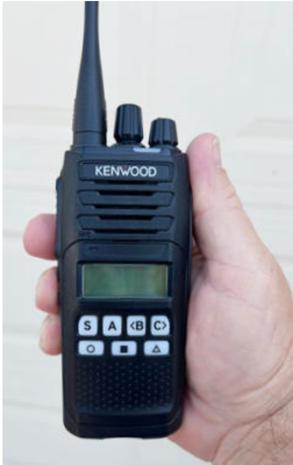
Kenwood NX-1000 5W portable sold by JCS Wireless

The Caravan-wide radio frequency "CVAN1" is 462.5750MHz. (GMRS Ch 16) with no privacy code. Some caravanners want to "chit-chat" with other club members or folks traveling with them. If that's you, we suggest you pick another GMRS frequency on which to do that, however, you should avoid GMRS ch. 20, which some consider the nationwide "emergency" frequency, and avoid GMRS ch. 21 which is reserved for the Caravan Leadership. Many GMRS mobiles and handi-talkies have a scanning feature. If your radio has that, we suggest putting CVAN1 as your priority channel.